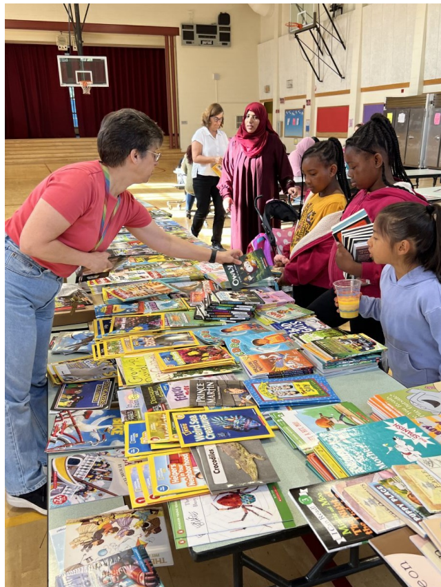
Students select additional summer reading.